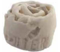
4. Van de Gevel: Here I am , 2019, porcelain, 30 x 30 x 20mm.