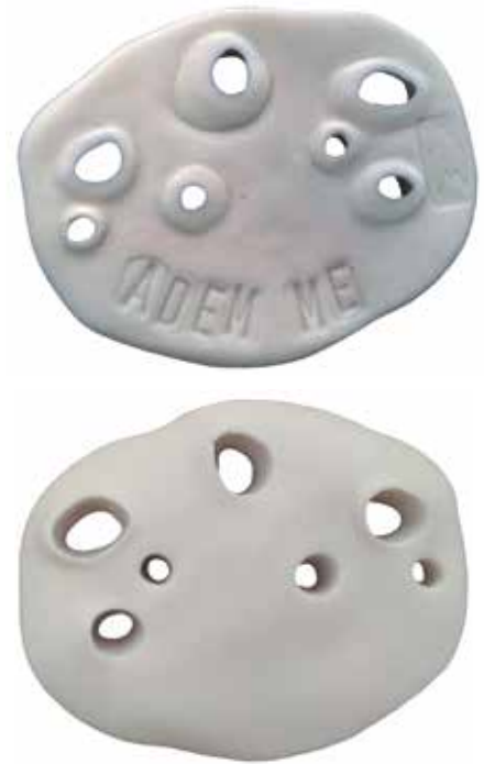
2. Van de Gevel: Breathe me , 2019, porcelain, 57 x 45 x 6mm.

story mixes with what the viewer experiences. While the viewer is looking at and touching the medal, it gradually takes on the temperature of his/her hands.