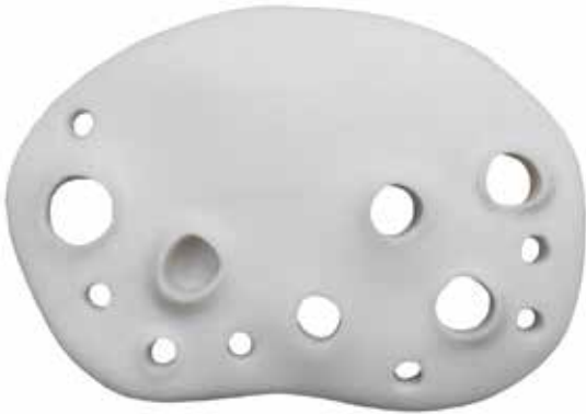
3. Van de Gevel: Breathe me , 2020, porcelain, 72 x 50 x 7mm.