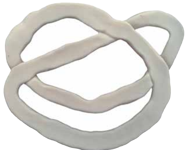
5. Van de Gevel: Flow of breath me , 2019, porcelain, 82 x 63 x 5mm.