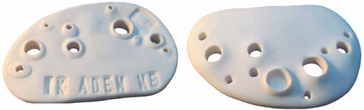
10. Van de Gevel: I breathe me , 2020, porcelain, 72 x 45 x 7mm.